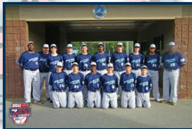
Brunswick County 13-Year-Old All-Stars

Do not worry if your District Tournament is not completed, go ahead and send Team Picture with names. Example to the right: